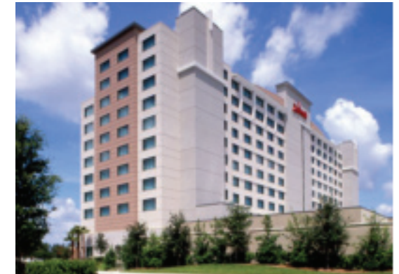
Lake Mary Marriott

1501 International Pkwy. • Lake Mary • Exit 101A on I-4